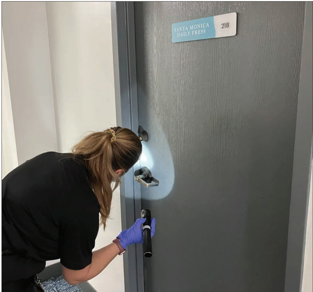
FORENSICS: The Santa Monica Daily Press office escaped harm during a burglary spree in the building last week. Scott Snowden

After removing the first group, city contractors returned to the property to begin a week’s worth of cleanup and another two homeless individuals were found in the property.